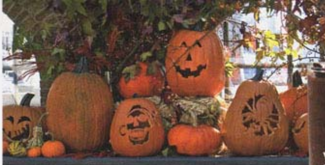
The Taharis' pumpkin patch

Autumn entertaining means designer FALL FETES and Halloween bashes