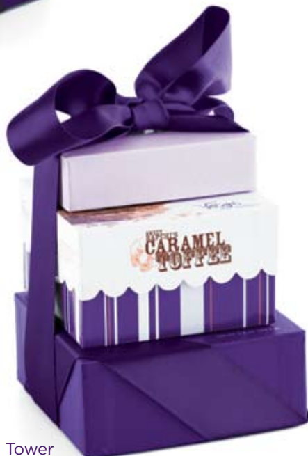
La Petite Tower