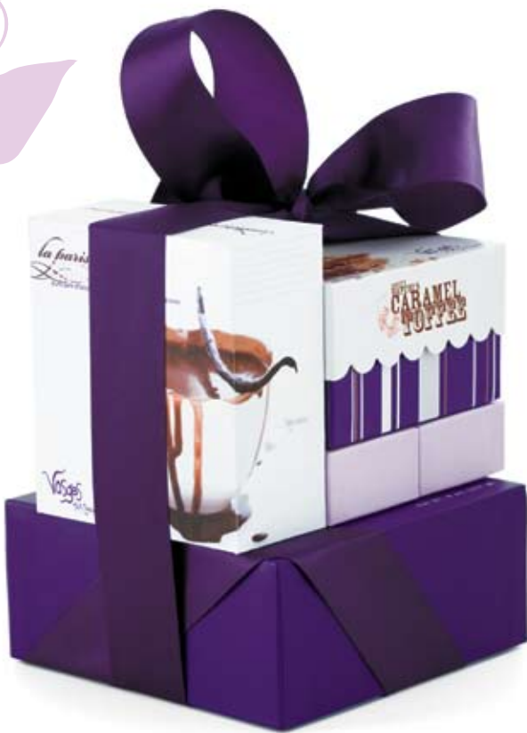
La Grande Tower