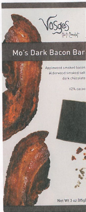
Photo Courtesy of Kiehl's; and vosgeschocolate.com; illustration by Mary Dunn

And thanks to its dual purpose—it's formulated for the hair and body—the masculine cleanser imparts a practicality that further enhances the chances he'll actually use it.